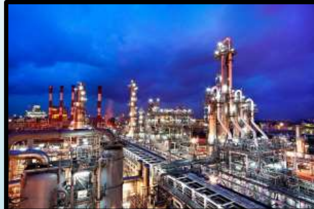
REFINERIES & PETROCHEMICAL